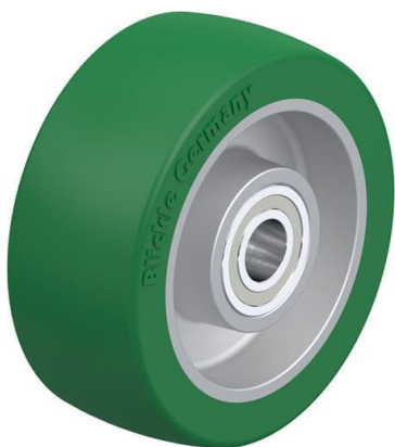
Wheel used ALST 100/15K