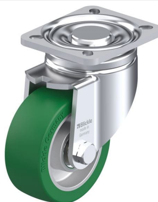
Corresponding swivel caster LH-ALST 100K-1