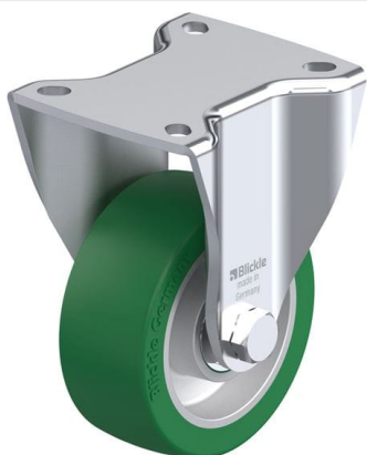
Corresponding rigid caster BH-ALST 100K-1