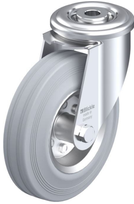
Corresponding swivel caster LER-VE 125R-SG