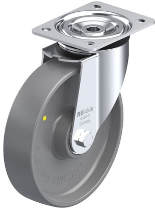
Corresponding swivel caster L-PO 200K-ELS