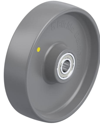
Wheel used PO 200/20K-ELS