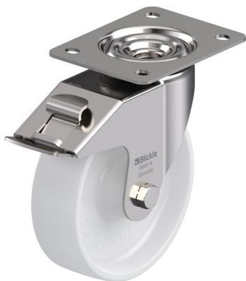
Corresponding standard locking LEX-PO 160XR-FI