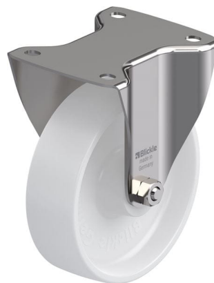
Corresponding rigid caster BX-PO 160XR