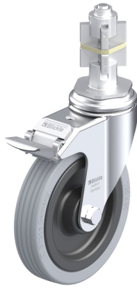
Corresponding standard locking LKRA-VPA 125K-11-FI-E17