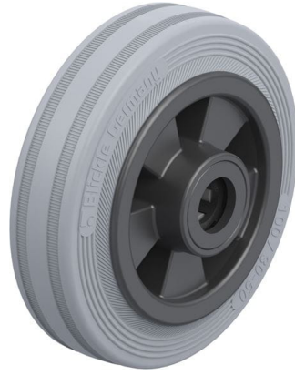
Wheel used VPP 100/12R-SG