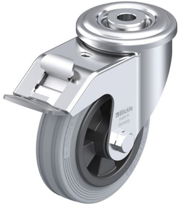
Corresponding standard locking LER-VPP 100R-FI-SG