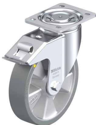
Corresponding standard locking LH-ALTH 200K-FI-AS