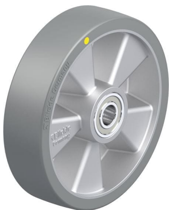
Wheel used ALTH 200/20K-AS