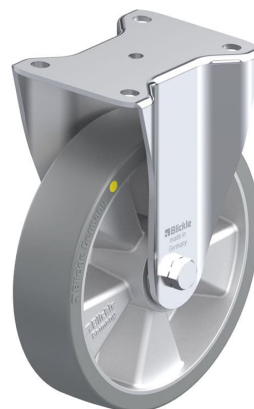
Corresponding rigid caster BH-ALTH 200K-AS