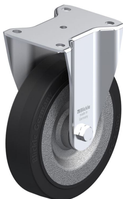
Corresponding rigid caster BH-SE 200K