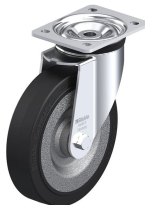
Corresponding swivel caster LK-SE 200K