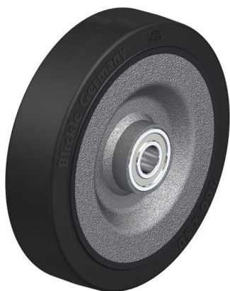
Wheel used SE 200/20K