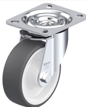
Corresponding swivel caster L-POTH 100R