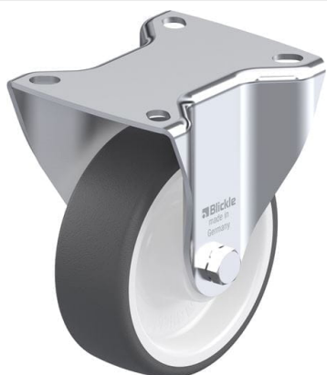
Corresponding rigid caster B-POTH 100R