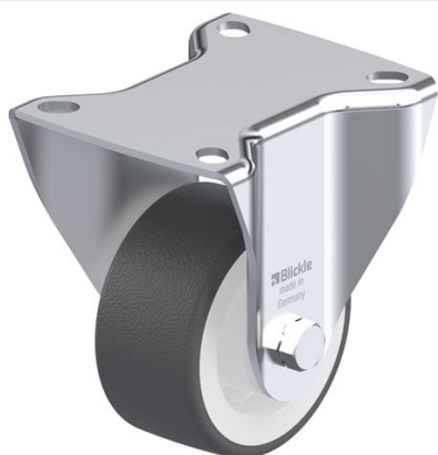
Corresponding rigid caster BK-POTH 75G