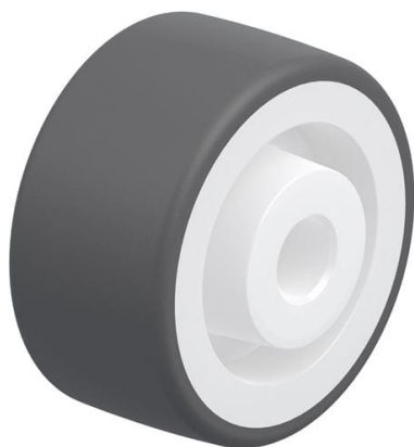
Wheel used POTH 75/15G