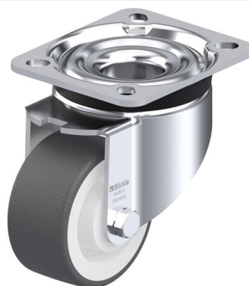
Corresponding swivel caster LK-POTH 75G