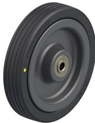
Wheel used VPA 125/8K-EL