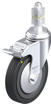
Corresponding standard locking LKRA-VPA 125K-11-FI-EL-FA-E14