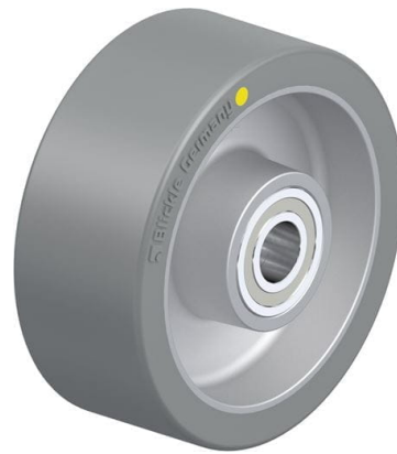
Wheel used ALTH 100/15K-AS