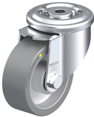
Corresponding swivel caster LKR-ALTH 100K-AS