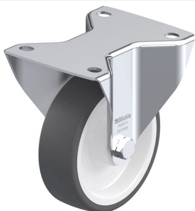
Corresponding rigid caster BK-POTH 125R-3