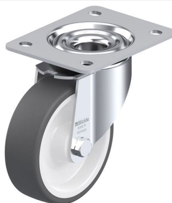
Corresponding swivel caster LK-POTH 125R-3