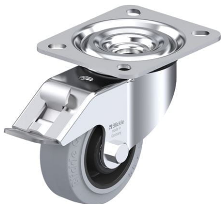
Corresponding standard locking L-POEV 80R-FI-SG