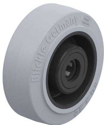
Wheel used POEV 80/12R-SG