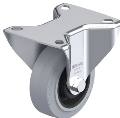
Corresponding rigid caster B-POEV 80R-SG