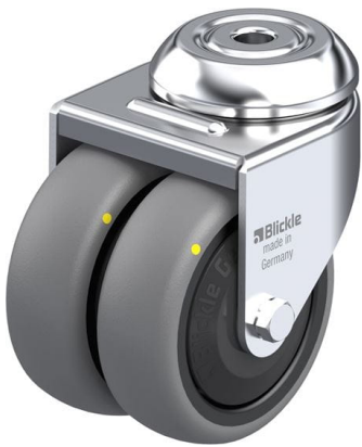
Corresponding swivel caster LMDA-TPA 75KF-ELS