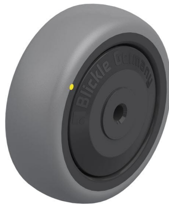
Wheel used TPA 75/6KF-ELS