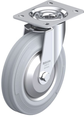
Corresponding swivel caster LE-VE 200R-SG-FA