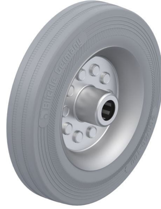
Wheel used VE 200/20R-SG