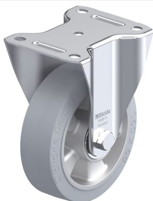
Corresponding rigid caster B-ALEV 150K-SG