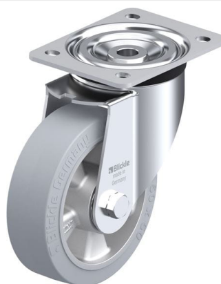
Corresponding swivel caster L-ALEV 150K-SG