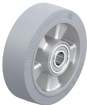
Wheel used ALEV 150/20K-SG