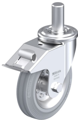
Corresponding standard locking LEZ-VE 160R-27-FI-SG