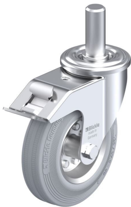
Corresponding standard locking LEZ-VE 125R-FI-SG