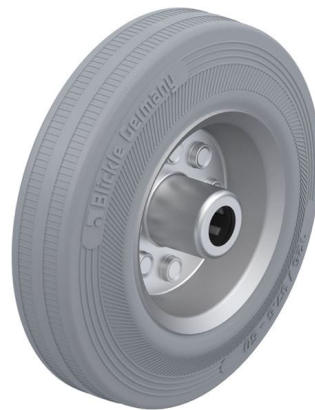
Wheel used VE 125/12R-SG