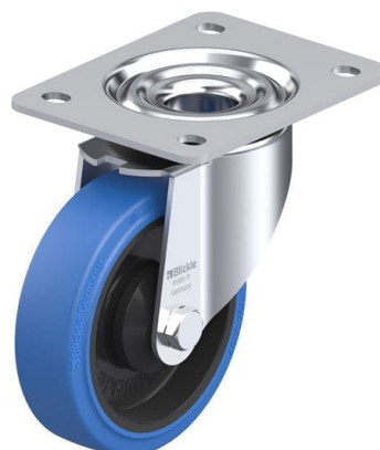
Corresponding swivel caster LK-POEV 125KA-3-SB