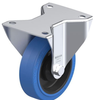
Corresponding rigid caster BK-POEV 125KA-3-SB