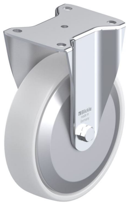
Corresponding rigid caster BH-PO 200K-FA