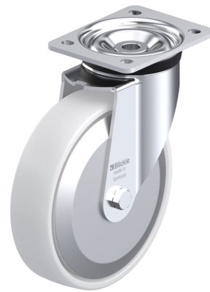
Corresponding swivel caster LK-PO 200K-FA