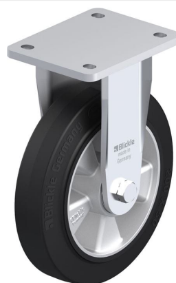
Corresponding rigid caster BO-ALEV 200K