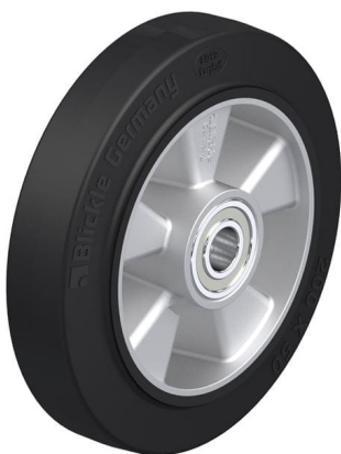
Wheel used ALEV 200/20K