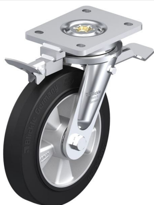
Corresponding standard locking LO-ALEV 200K-ST-RI4