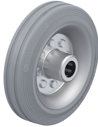
Wheel used VE 150/20R-SG