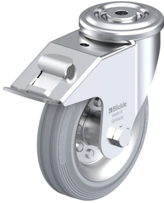
Corresponding standard locking LER-VE 150R-FI-SG