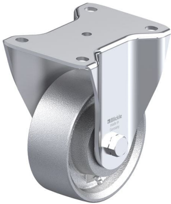
Corresponding rigid caster BH-G 127K