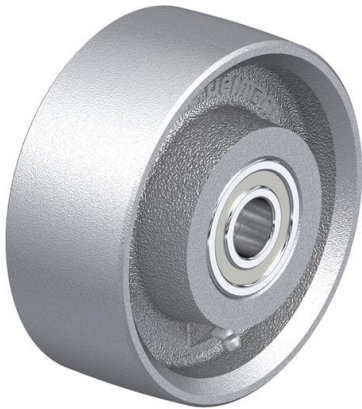
Wheel used G 127/20K