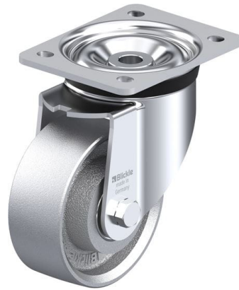
Corresponding swivel caster LK-G 127K