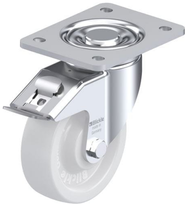
Corresponding standard locking LH-SP0 125G-3-FI