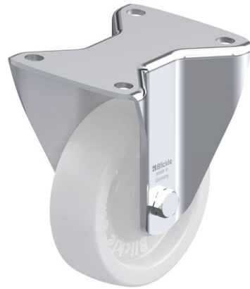
Corresponding rigid caster BH-SP0 125G-3