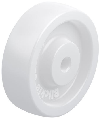
Wheel used SP0 125/15G