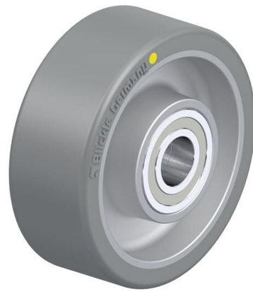
Wheel used ALTH 80/15K-AS