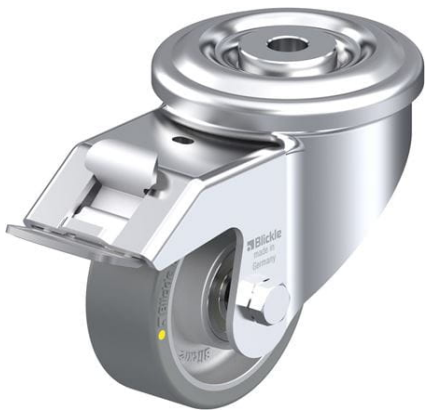
Corresponding standard locking LKR-ALTH 80K-FI-AS