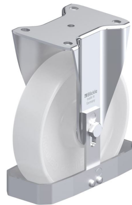
Corresponding rigid caster BH-PO 200K-FS