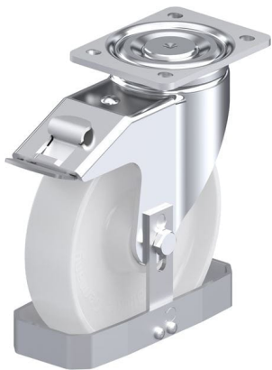
Corresponding standard locking LH-PO 200K-FI-FS