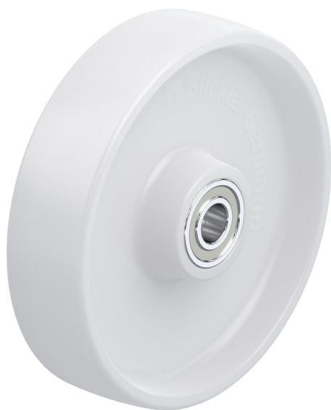
Wheel used PO 200/20K