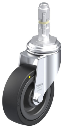
Corresponding swivel caster LKRA-VPA 101K-11-EL-E12