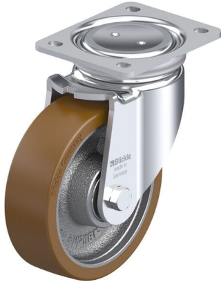
Corresponding swivel caster LUH-GB 160K