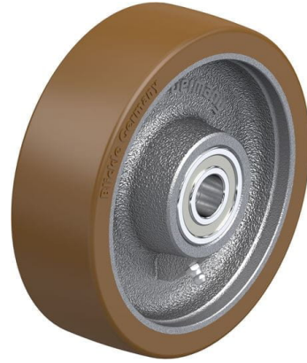
Wheel used GB 160/20K