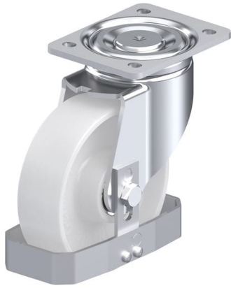
Corresponding swivel caster LH-PO 160K-FS