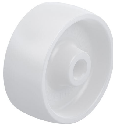
Wheel used PO 75/12G