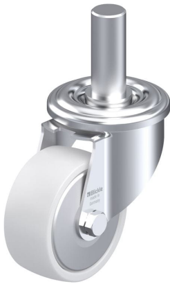
Corresponding swivel caster LEZ-PO 75G-FA