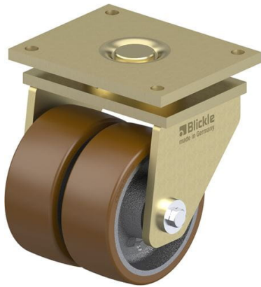
Corresponding swivel caster LSD-GB 202K