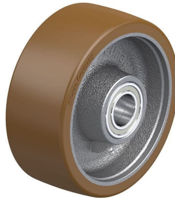
Wheel used GB 202/35K