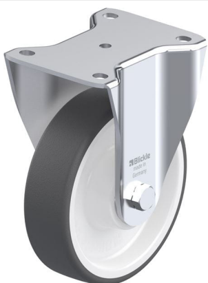
Corresponding rigid caster BH-POTH 160K