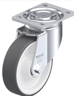
Corresponding swivel caster LH-POTH 160K