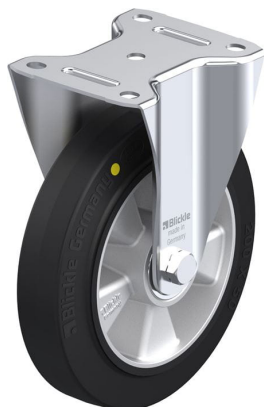
Corresponding rigid caster B-ALEV 200K-EL