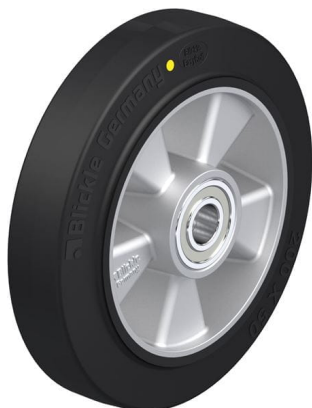
Wheel used ALEV 200/20K-EL