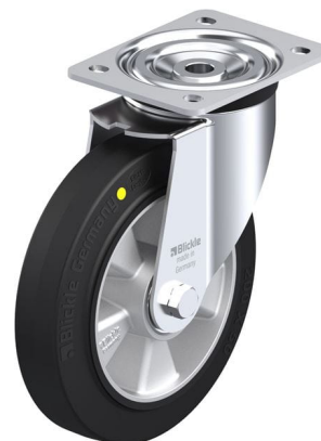
Corresponding swivel caster L-ALEV 200K-EL