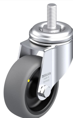
Corresponding swivel caster LKRA-TPA 80G-ELS-GS12