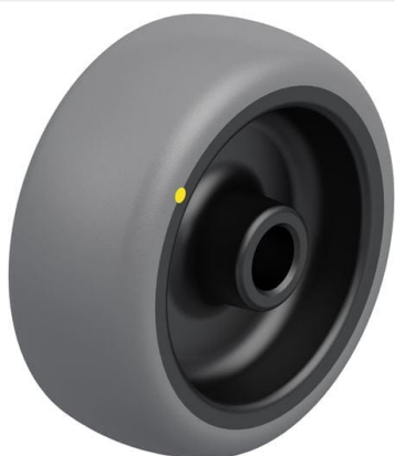
Wheel used TPA 80/12G-ELS