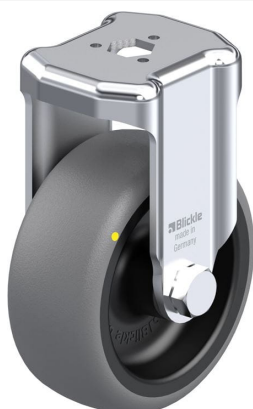
Corresponding rigid caster BKRA-TPA 80G-ELS