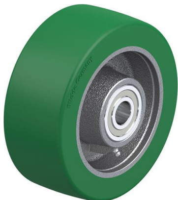
Wheel used GST 202/25K