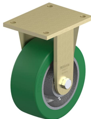
Corresponding rigid caster BS-GST 202K