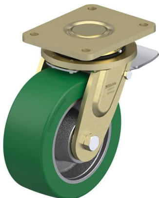
Corresponding standard locking LS-GST 202K-ST