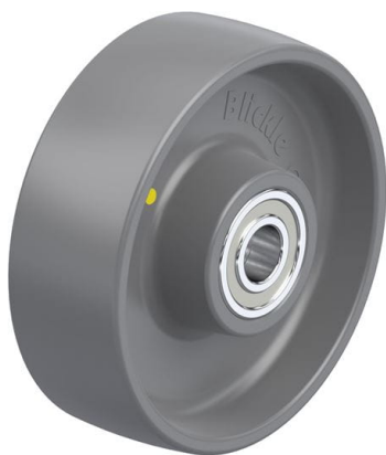
Wheel used PO 150/20K-ELS