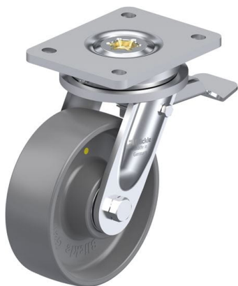
Corresponding standard locking LO-PO 150K-ST-ELS