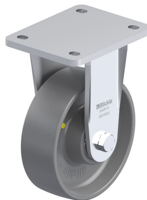
Corresponding rigid caster BO-PO 150K-ELS