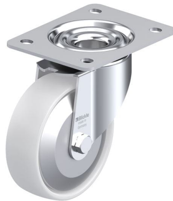
Corresponding swivel caster LK-PO 125G-3-FA