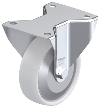
Corresponding rigid caster BK-PO 125G-3-FA