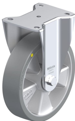
Corresponding rigid caster BH-ALTH 200K-AS