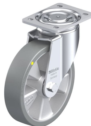
Corresponding swivel caster LH-ALTH 200K-AS