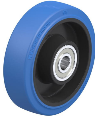
Wheel used POEV 125/15K-SB