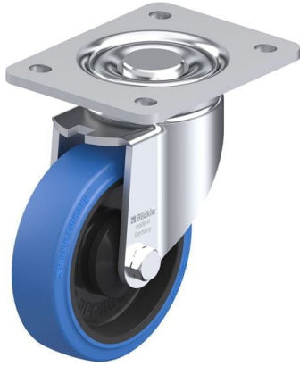
Corresponding swivel caster LH-POEV 125K-3-SB