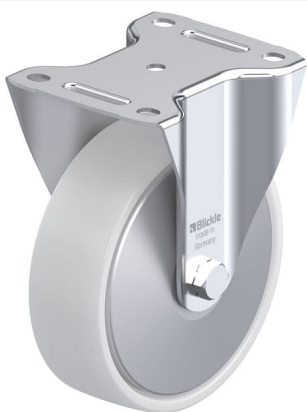
Corresponding rigid caster B-PO 160XR-FA