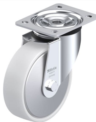
Corresponding swivel caster L-PO 160XR-FA