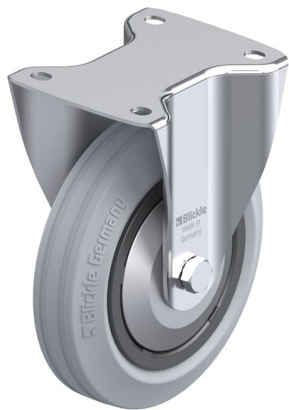
Corresponding rigid caster B-VPP 180R-SG-FA