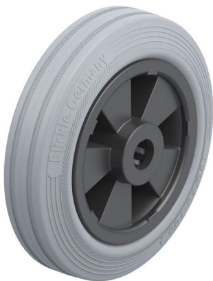
Wheel used VPP 180/20R-SG