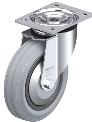
Corresponding swivel caster L-VPP 180R-SG-FA