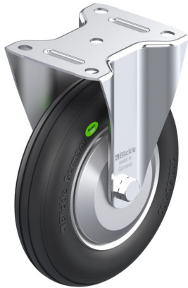
Corresponding rigid caster B-VW 202R-FA