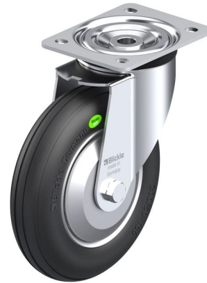
Corresponding swivel caster L-VW 202R-FA