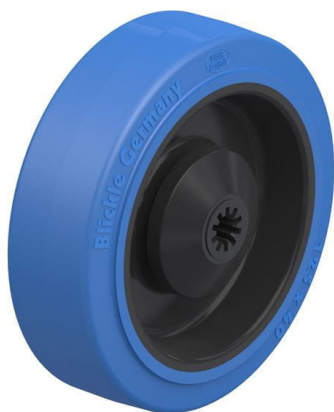
Wheel used POEV 125/8KA-SB