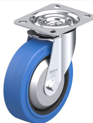
Corresponding swivel caster LE-POEV 125KA-SB-FA