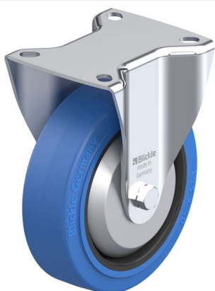
Corresponding rigid caster B-POEV 125KA-SB-FA