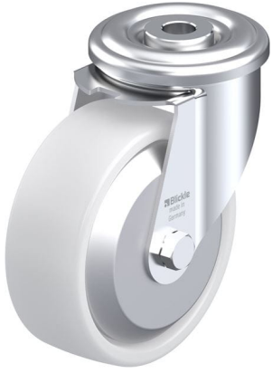
Corresponding swivel caster LER-PO 100KA-FA