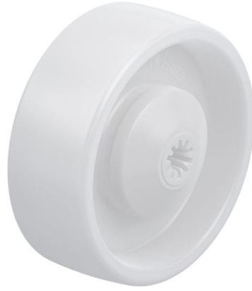
Wheel used PO 100/8KA