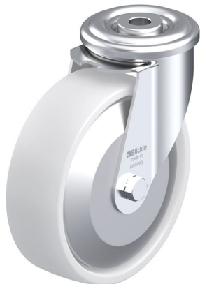
Corresponding swivel caster LER-PO 125KA-FA