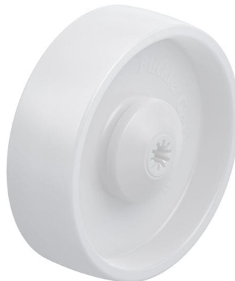
Wheel used PO 125/8KA