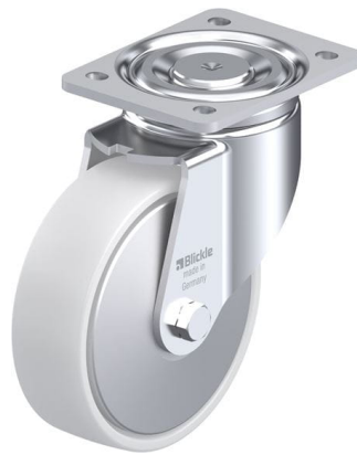
Corresponding swivel caster LH-PO 160K-FA