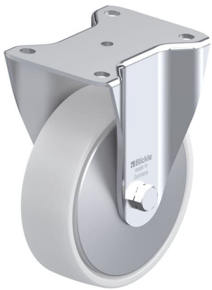
Corresponding rigid caster BH-PO 160K-FA