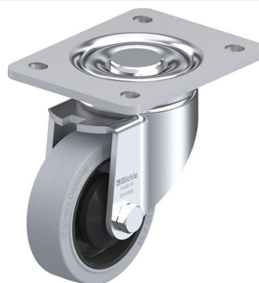
Corresponding swivel caster LH-POEV 100K-3-SG