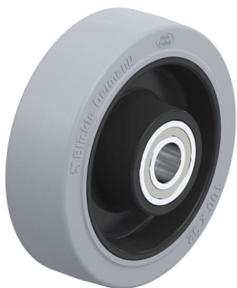
Wheel used POEV 100/15K-SG