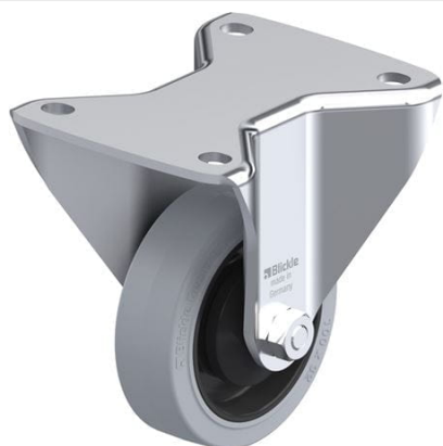
Corresponding rigid caster BH-POEV 100K-3-SG