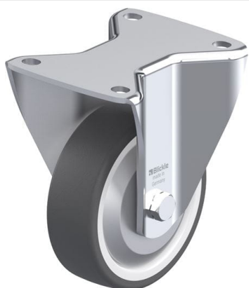
Corresponding rigid caster BH-POTH 125G-3-FA