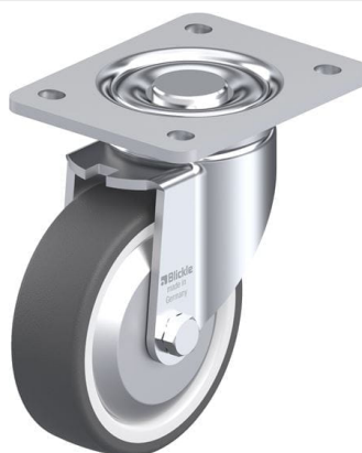
Corresponding swivel caster LH-POTH 125G-3-FA