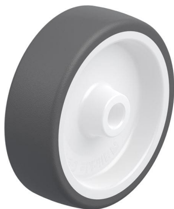
Wheel used POTH 125/15G