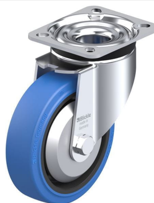
Corresponding swivel caster LK-POEV 125R-1-SB-FA