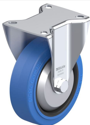
Corresponding rigid caster BK-POEV 125R-1-SB-FA